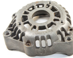
Slip Ring Ends Drive Ends