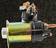
PARTS & ELECTRICAL SYSTEM SPECIALTY SUPPLIES