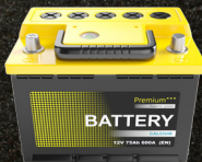
BATTERIES, CHARGERS, CABLES, CONVERTERS, WIRING